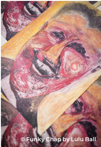
© Funky Chap by Lulu Ball

Before the subscription model comes into play, we are looking for artists whose work we will license.